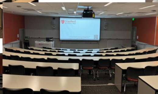
Ling Ka Shing classroom 130