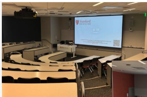
Ling Ka Shing classroom 120