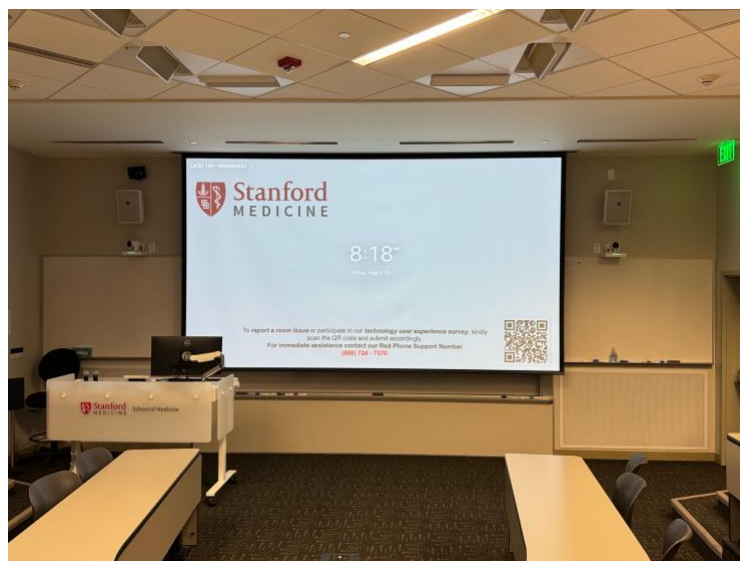
A view of Li Ka Shing Center classroom 120.

To simplify your teaching experience, we're also installing an updated lectern with an intuitive control system that lets you power up and manage all AV equipment in seconds, freeing you to focus on instruction rather than technology. These enhancements will not only improve day-to-day reliability but also position our classrooms for future innovations in hybrid and active-learning formats.