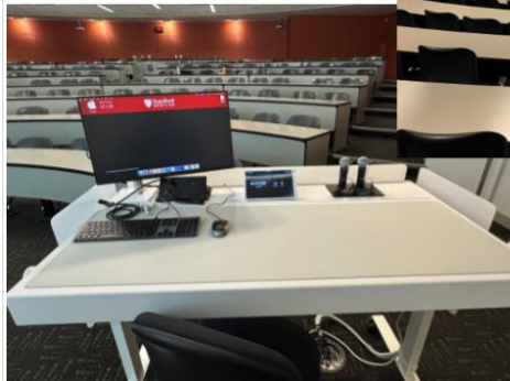
Instructor's view of a new lectern in Ling Ka Shing 130