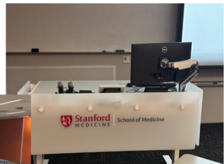
A front view of a new lectern in Ling Ka Shing 130